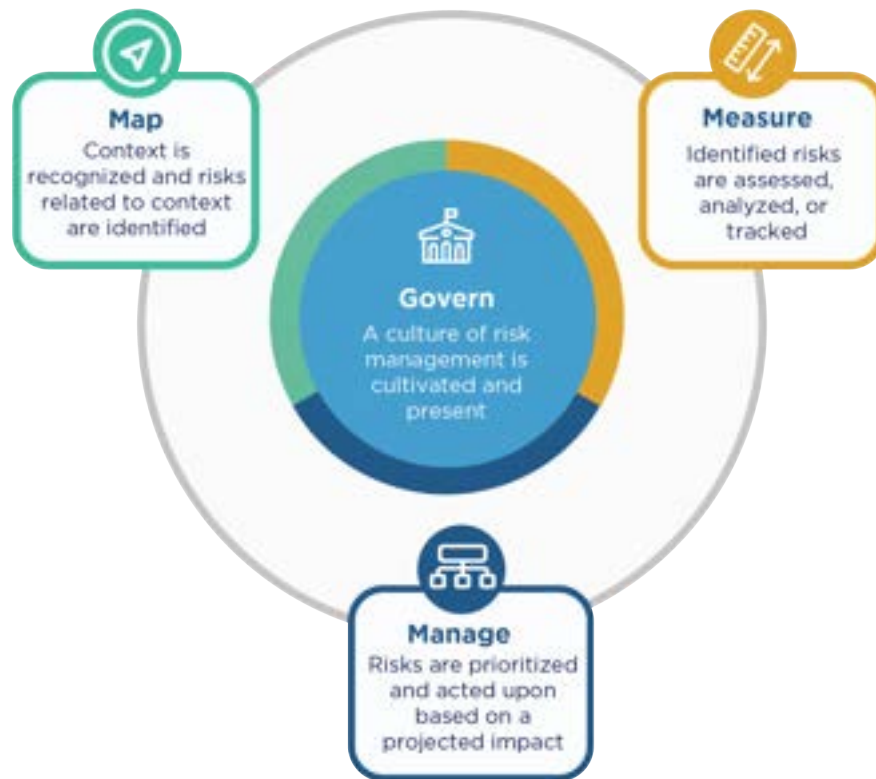
Fig. 5. Functions organize AI risk management activities at their highest level to govern, map, measure, and manage AI risks. Governance is designed to be a cross-cutting function to inform and be infused throughout the other three functions.

The AI RMF Core provides outcomes and actions that enable dialogue, understanding, and activities to manage AI risks and responsibly develop trustworthy AI systems. As illustrated in Figure 5, the Core is composed of four functions: GOVERN , MAP , MEASURE , and MANAGE . Each of these high-level functions is broken down into categories and sub-categories. Categories and subcategories are subdivided into specific actions and outcomes. Actions do not constitute a checklist, nor are they necessarily an ordered set of steps.