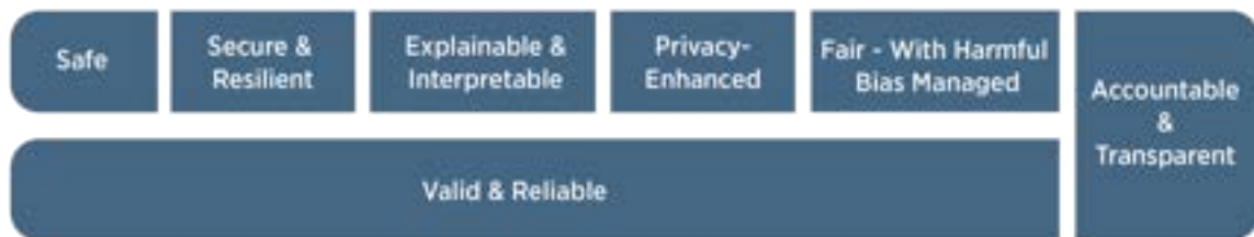
Fig. 4. Characteristics of trustworthy AI systems. Valid & Reliable is a necessary condition of trustworthiness and is shown as the base for other trustworthiness characteristics. Accountable & Transparent is shown as a vertical box because it relates to all other characteristics.

For AI systems to be trustworthy, they often need to be responsive to a multiplicity of criteria that are of value to interested parties. Approaches which enhance AI trustworthiness can reduce negative AI risks. This Framework articulates the following characteristics of trustworthy AI and offers guidance for addressing them. Characteristics of trustworthy AI systems include: valid and reliable, safe, secure and resilient, accountable and transparent, explainable and interpretable, privacy-enhanced, and fair with harmful bias managed . Creating trustworthy AI requires balancing each of these characteristics based on the AI system's context of use. While all characteristics are socio-technical system attributes, accountability and transparency also relate to the processes and activities internal to an AI system and its external setting. Neglecting these characteristics can increase the probability and magnitude of negative consequences.