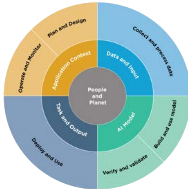
Fig. 2. Lifecycle and Key Dimensions of an AI System. Modified from OECD (2022) OECD Framework for the Classification of AI systems — OECD Digital Economy Papers . The two inner circles show AI systems’ key dimensions and the outer circle shows AI lifecycle stages. Ideally, risk management efforts start with the Plan and Design function in the application context and are performed throughout the AI system lifecycle. See Figure 3 for representative AI actors.

environmental groups, civil society organizations, end users, and potentially impacted individuals and communities. These actors can: