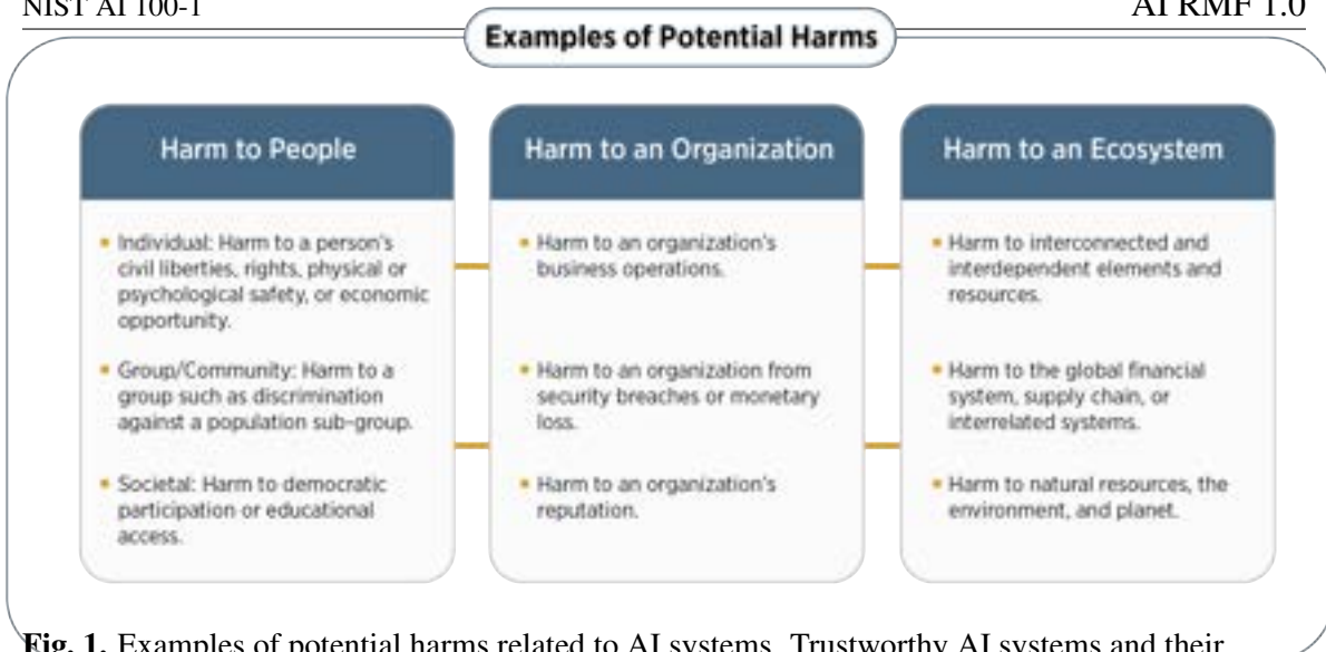
Fig. 1. Examples of potential harms related to AI systems. Trustworthy AI systems and their responsible use can mitigate negative risks and contribute to benefits for people, organizations, and ecosystems.